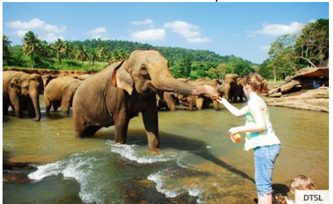
Pinnawala Elephant Orphanage