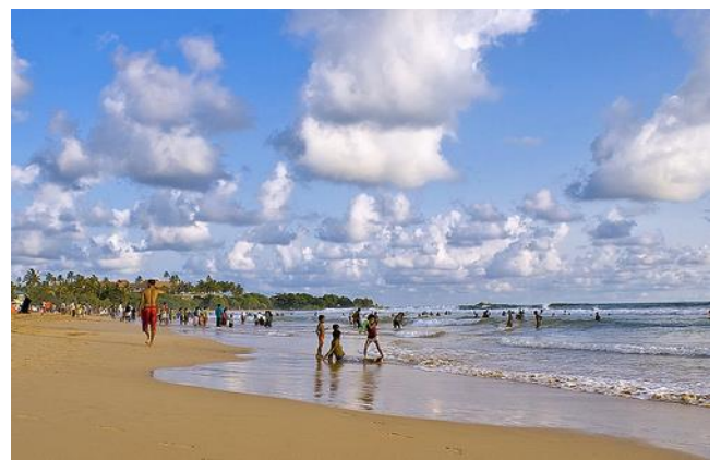
Leisure at beach.