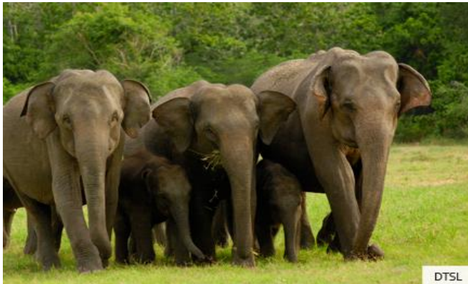
Minneriya National Park.