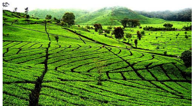
Tea Plantation Nuwara Eliya.