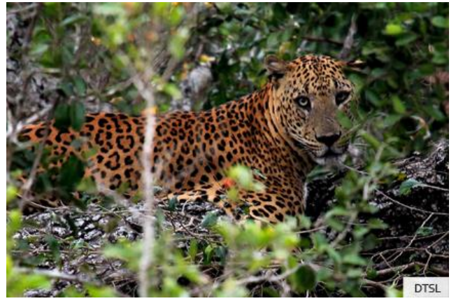
Yala National Park Safari