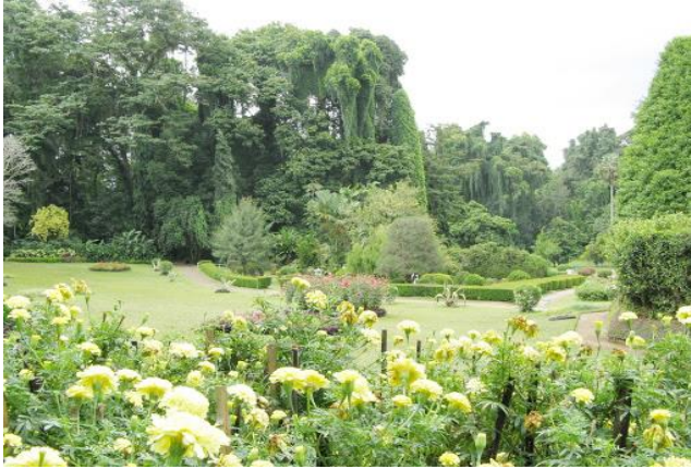
Peradeniya Botanical Garden